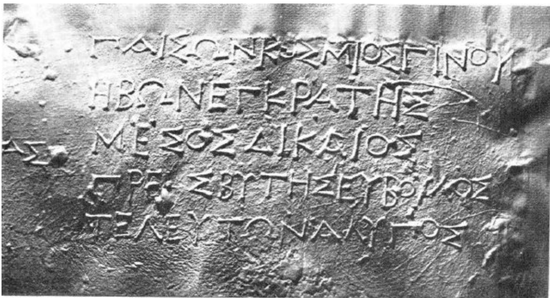
FIG. 5. - Estampage de l'inscription des maximes.